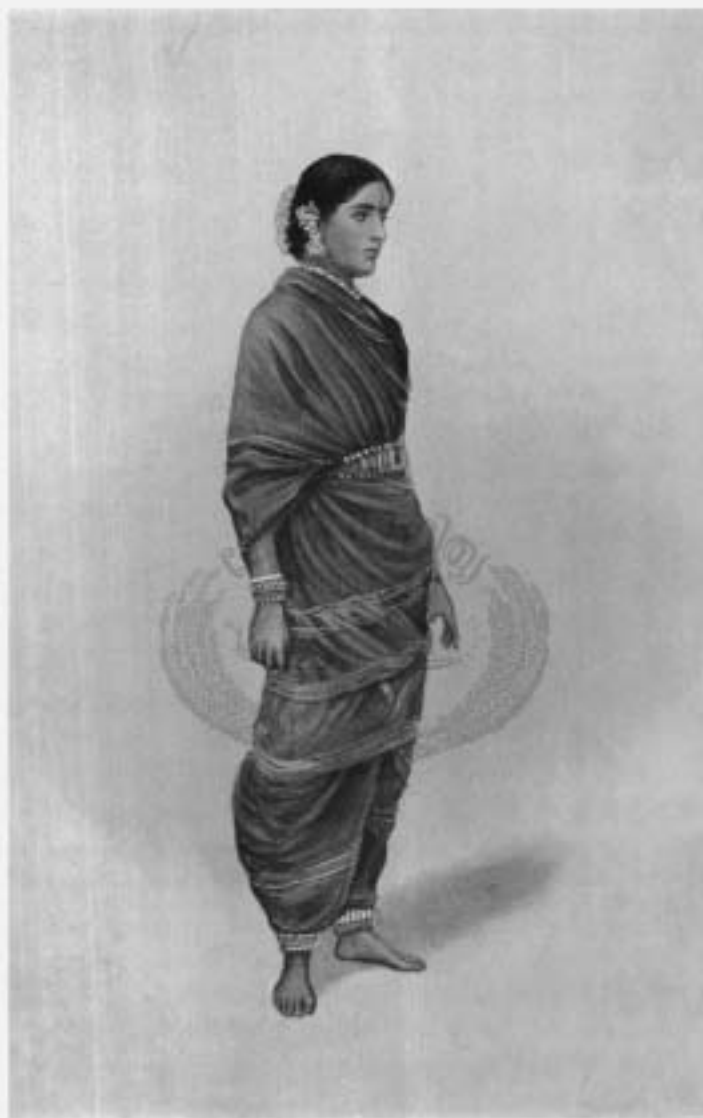
DANCER FROM TANJORE